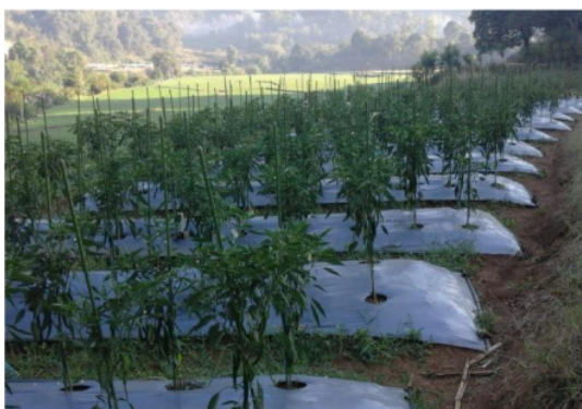
Fig. 5: Growth of monoculture chilli plants (using plastic mulch)

The monoculture chili cultivation with the use of plastic mulch plant growth is shown in figure 5. Figure 5 shows that the use of plastic mulch seems to make thrips less comfortable living in plants. Due to the use of plastic mulch, it is usually utilized to reduce the growth of weeds, which is sometimes an alternative host for insect pests. Also, the silver color of plastic mulch has been shown to reduce certain insect pests [9]. Studies conducted in the journal article in [18] show that growing vegetable crops using silver mulch is an effective method for reducing T. palmi populations and must be considered in integrated pest control (IPM) program for this insect species.