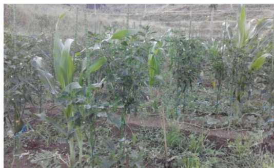
Fig. 2: Growth of chili plants intercropped with corn and watermelon

It seems that thrips are more inclined to chili plants without plastic mulch that was also planted together with corn and watermelon. The growth of each plant can be seen in Figure 2. Due to shade, this may have caused a sort of partial blockage of sunlight by the corn or watermelon leaves, thus making thrips feel at home in the plant chili. Different results when corn is intercropped with tomatoes, such as a journal article in [17] comparing four intercropping systems involving kale, onions, corn, and tomatoes, found that the thrips population was lower than other intercropping combinations only that the weight of the tomatoes produced was low.