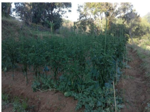
Fig. 4: Growth of pepper plants intercropped with watermelons

The growth of watermelon which spreads over the surface of the soil under the chili, besides suppressing weeds naturally also seems to make it a strategic place for arthropods, natural enemies of pests to take shelter. A journal article in [7] that uses cover crops on maple plants, reveals that overall cover crops do not add to the damage by red maple pests. However, careful attention must be paid to selecting ground cover plants so they do not compete with the main tree for nutrients, water, and space so that the main plant growth remains optimal. A journal article in [6] states that the use of cover crops from wheat and clover on cotton plants revealed that cover crops significantly reduced thrips attacks. Also, chinch infestation decreases in plots prepared with wheat cover compared to cotton which lacks this additional habitat.