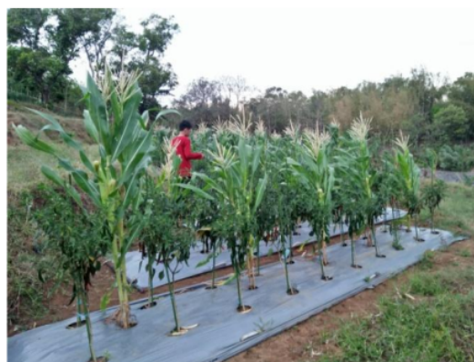
Fig. 3: Growth of chili plants intercropped with corn (using plastic mulch)

The diversity of vegetation created by planting chili peppers with corn and watermelon does not seem to make it a controller of thrips on chili plants. On the contrary, there are more thrips populations in chili plants that are intercropped with chili, corn, and watermelons compared to chili plants grown in monocultures. It could be due to its role as a shelter for pests. The existence of other plants, although not a host in the intercropping system, might increase the pest population due to the availability of places for pests to lay eggs [9]. The same thing stated in the journal article in [3], that crop diversity in a cropping pattern does not mean reducing pest populations because of many factors that influence it.