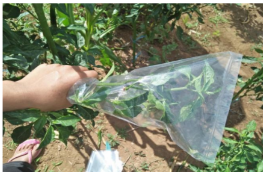
Fig. 1: Catching thrips on chili plants

Thrips were captured using a clear plastic bag measuring 20 cm x 30 cm, by covering the shoots of the plant and then pat the plant until the thrips fall into a plastic bag (figure 1).